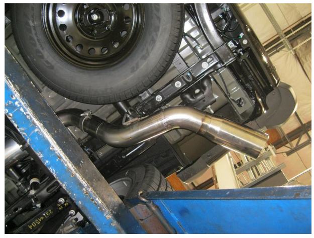
Step 4. Finish by installing the Tail Pipe Assembly to the over axle Resonator assembly using the supplied 4.00" clamp, fitting the welded hanger into rubber insulator.

MAGNAFLOW: 22961 Arroyo Vista - Rancho Santa Margarita, CA 92688 | 1(800) 990-0905 Technical Support: 1(800) 959-9226 | Email: moreinfo@magnaflow.com